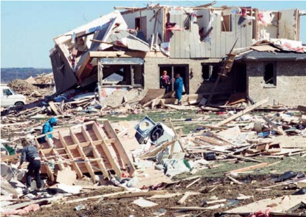
Clean-up work being done in Lemont, Illinois, after a tornado came through the area on March 27, 1991.