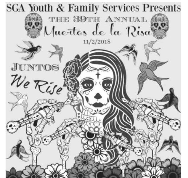
SGA Youth & Family Services will be hosting Muertos de la Risa at Dvorak Park, 1119 W. Cullerton st., on Friday, Nov. 2nd. The schedule includes: 3:30 - 5:45 p.m., Face Painting; 4:45 - 5:50 p.m., Music and dancing; 6-7 p.m., Community procession, featuring large puppets, hand-pushed carts and ofrendas; 7 - 7:45 p.m., Refreshments and performances.