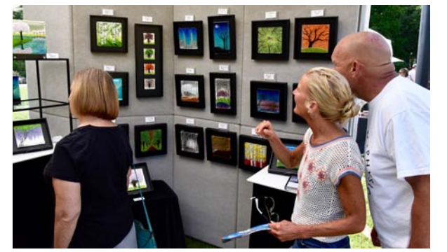
Wine and Art Walk.

During August, The Morton Arboretum of Lisle will offer special events and in-person and online programming for all ages. Nonmember guests must reserve admission online or by phone in advance of their visit.