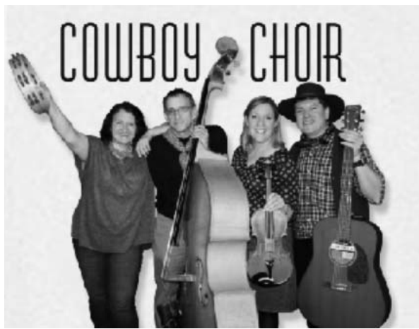
COWBOY CHOIR BAND

The McKinley Park Advisory Council will sponsor the Farmers Market Summer Concert Series at the President Monument, Archer & Western blvd. on Sundays from 12 noon to 1:15 p.m. Attendees should bring a chair or blanket.