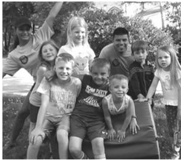
The Chicago Park District will send the Rollin' Rec activity van to Hoyne Playground, 3417 S. Hamilton on Tuesdays through Aug. 14th and Thursdays through Aug. 16th from 1:30 to 2:30 p.m.

Sports, gymnastics and fitness activities will be available for all ages. Registration is not required.