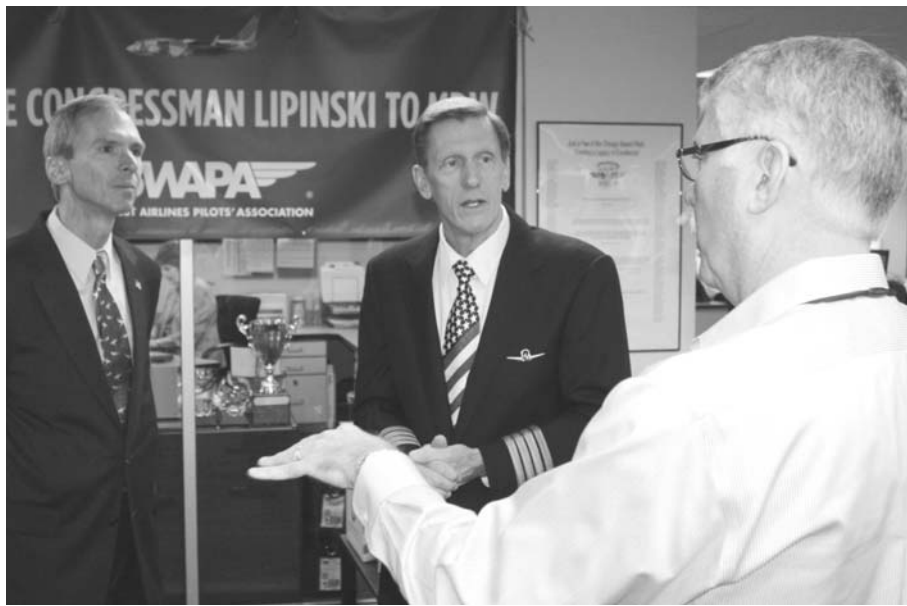
Rep. Dan Lipinski (left) visited Midway Airport to meet with pilots from Southwest Airlines.

Congressman Dan Lipinski (IL-3), the state's senior member on the House Transportation & Infrastructure Committee, sent a letter to the Federal Aviation Administration urging a stop to any plans for an overnight closure of the air traffic control tower at Midway Airport.