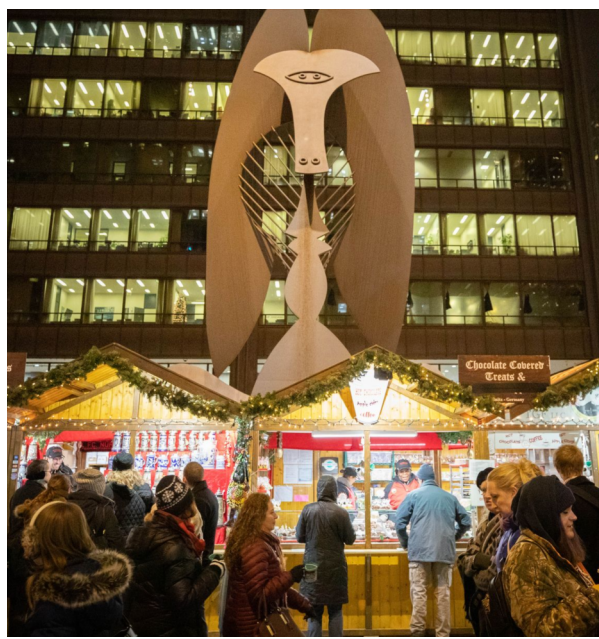
Christkindlmarket at Daley Plaza

Chicago Loop Alliance annually compiles a detailed guide of recommended experiences, restaurants, hotels, Loop deals, Santa in the Loop, and more. The most popular seasonal attractions and downtown businesses are featured in printed pocket guides and updated online Holidays in the Loop guide. View the guide and earn a chance to win a $1,000 Loop Staycation package at LoopChicago.com/Holidays.