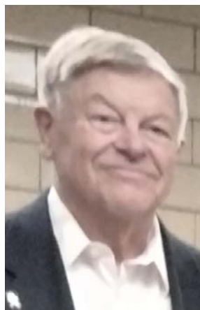
By Dr. R. Pletsch

The US border continues to be flooded by illegal aliens. That's both the northern and southern borders. No one is sure of an accurate account of how many have entered because the U.S. government refuses to follow the law. Many polls indicate these numbers to be at least 7 or 8 million people. These polls also indicate that this lack of control of the borders was one of the instrumental reasons that the Republicans won the election very convincingly.