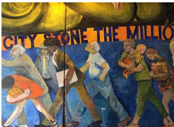
Walking Tour, Hyde Park Murals.