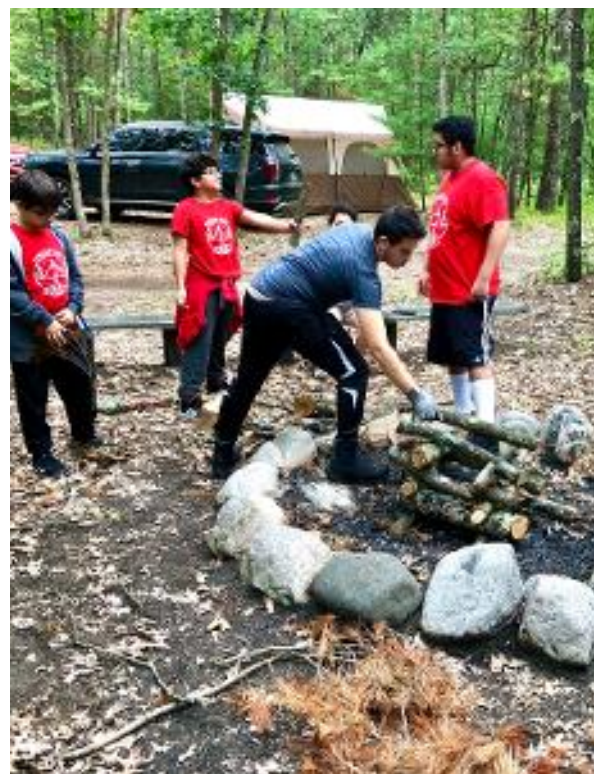
Members of Troop 1441 apply their skills for rank advancement at fire building.