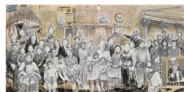
Herstory 1& 2 by Chang C. Chen, opens a new window / Copyright Chang C. Chen / Cropped from original

Exhibit Herstory: The Legal History of Čhinese American Women is open legal tradition, as they at the Chinatown Branch Library, 2100 Wentworth through March 31st, in celebration of Women's History Month. Curated by author and legal scholar Chang C. Chen, Herstory illustrates the struggle for Chinese women to attain citizenship, dignity and recognition under the