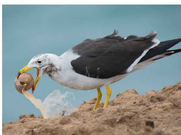
Photos featured on the exterior wall of Brookfield Zoo's Living Coast habitat and in the book, Punta San Juan: a conservation story.

Brookfield Zoo announces the installation of a captivating photo gallery on the exterior wall of The Living Coast, featuring 32 images that highlight the landscapes and animals of the Punta San Juan Marine Protected Area in Peru, South America.