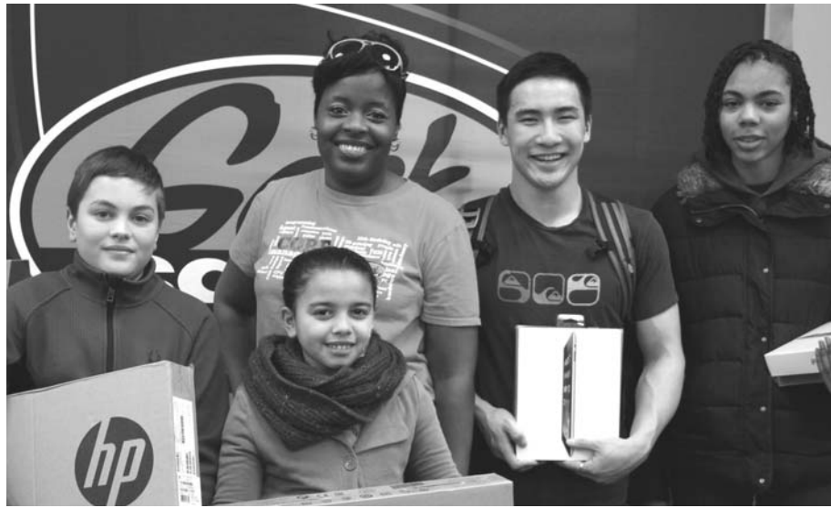
Hundreds of young Chicagoans, along with their parents and teachers, plus representatives of two dozen youth-serving organizations, converged at Jones College Prep on Jan. 24th for the second annual Destination: Chicago - Winter Break.