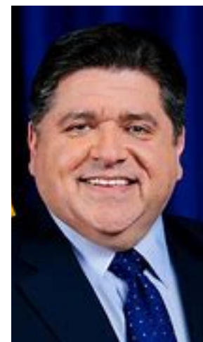
ILLINOIS GOVERNOR J.B. PRITZKER

The remediations implemented thus far do not satisfy IEPA stan-