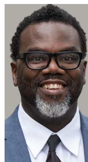
MAYOR B. JOHNSON

Mayor Brandon Johnson has launched "A Day in the Ward," aimed at fostering collaboration between the City and neighborhoods. This initiative will showcase the City's investments in local communities, providing a platform for residents to connect with leaders and experience the resources available.