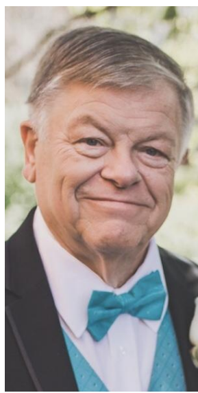
By Dr. R. Pletsch

Many of you reading this article have heard the term "woke". It has become a term used for all phrases or words that many in the progressive wing of the Democratic party to be wrong or offensive. In fact, they have been named in numerous lawsuits that it denies the basic First Amendment Rights. We in the neighborhood wouldn't see this much, but the people who defend "woke" are not just political activists, they have seemingly influenced many companies and schools to follow what they say -- no questions. If you are using these terms, many companies and schools have fired or demoted people. Most people, whether they believe it or not, follow their company's or school's dictates because their job is important to them. Some people believe that if you are an elected official or a minority, fol-