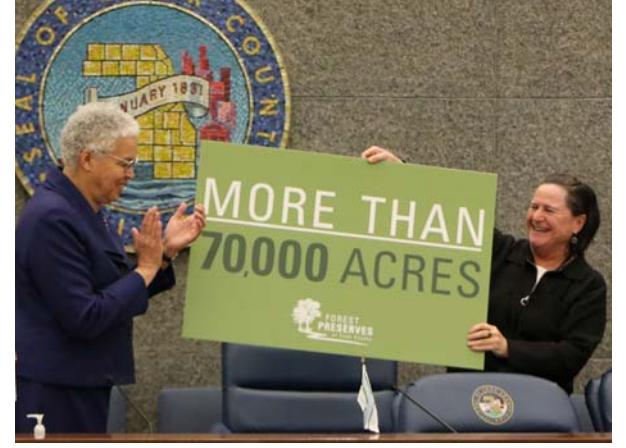
Forest Preserves of Cook County Board President Toni Preckwinkle and Interim General Superintendent Eileen Figel celebrate the agency's major milestone: officially holding more than 70,000 acres. The moment followed a vote by the Board of Commissioners to approve the purchase of a 68-acre parcel in Southeast Suburban Cook County.

The Forest Preserves of Cook County has reached a momentous milestone, officially holding more than 70,000 acres of land for the first time in its 110-year history.