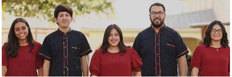
Bethany Baptist, 3532 S. Hoyne, will present Ambassadors music team during Sunday Worship on June 16th at 10 a.m. The message will be in Spanish with English translation. Saturday, June 15th, 7 p.m. Latin Amer-ican music and food will be on the patio with a concert by Grande Bible Seminary.