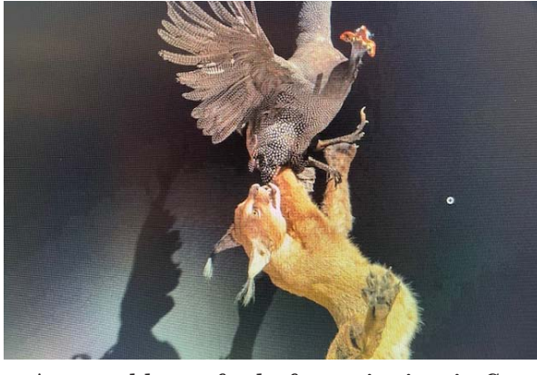
A caracal hunts fowls, frozen in time in Cats: Predators to Pets

Cats: Predators to Pets at the Field Museum features the science of cats and dives into our relations with cats around