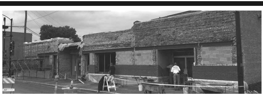
Starting our Second Century...to better serve our clients TODAY!

Early bird pricing is available until Sept. 4th. For more information, visit: https://www.adlerplanetarium.org/events/family-after-dark-sept-28/ .