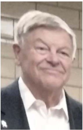
By Dr. R. Pletsch

The issue of only American citizens voting in Federal elections is considered very highly among the many who were polled on this issue. While Federal law prohibits non-citizens from voting in Federal elections, there are places that are allowing non-citizens to vote in local elections.