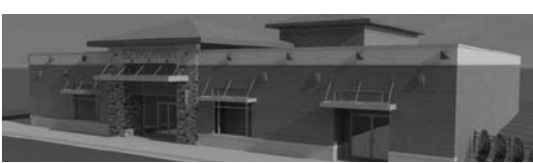
Starting our second century of service.

During our daily routines, we do business alongside other hardworking people. Even when we are outside of work - at the movies, the grocery store, driving on the highway - we encounter people who are working just as hard, even on weekends, night or at two jobs. Labor Day is a day to honor all of the men and women who work to provide for themselves and their families. Your efforts help keep our country and our communities strong, and we salute your commitment to a job well done. We hope you enjoy a great holiday weekend of festivities and relaxation.