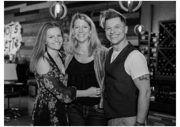
Pinot's Palette Logan Square, 2768 N. Milwaukee ave., invites ages 6 and older to paint animals with Pinot's artists and experts from Lincoln Park Zoo on Sunday, June 24th from 3 to 5 p.m.; Saturday, July 14th from 7 to 9 p.m. and Thursday, Aug. 23rd from 8 to 1 p.m. The cost is $40. For more information visit lpzoo.org/events .