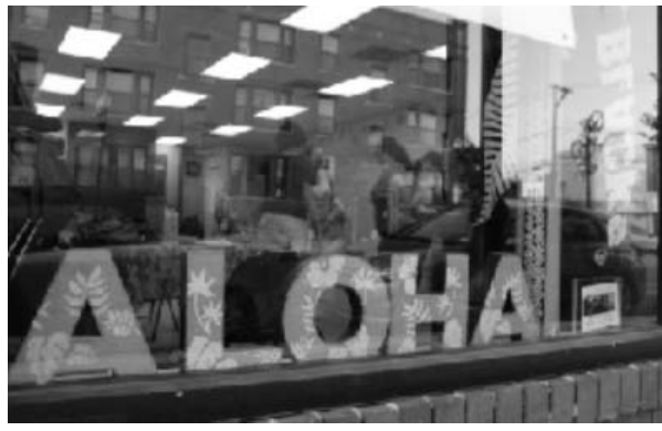
ALOHA CENTER BAND

The McKinley Park Advisory Council will sponsor the Farmers Market Summer Concert Series at the President Monument, Archer & Western blvd. on Sundays