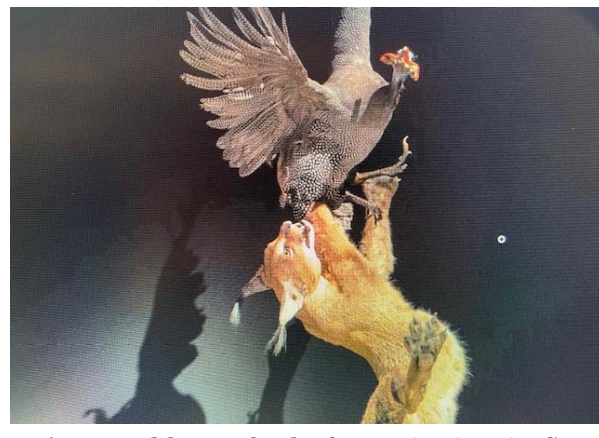
A caracal hunts fowls, frozen in time in Cats: Predators to Pets

Cats: Predators to Pets at the Field Museum features the science of cats and dives into our relations with cats around the