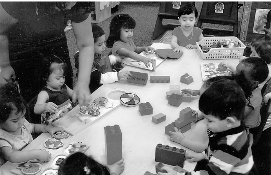
Kiddy Kare, 4401 S. Kedzie, is offering a toddler fun program for children age 15 to 36 months. Parents are invited to visit the school and view the classes in session. For further information, call (773) 247-6642.