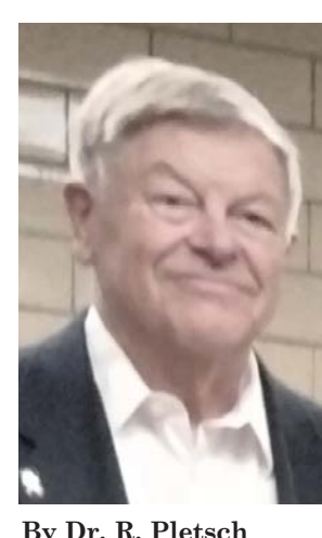
By Dr. R. Pletsch

The timeframe for Americans is short between now and when we will see who actually won the election as we had to meet the printer's deadline. If you listen to one set of commercials, Biden was never in power and Harris blames Trump for the border and the surge in crime. If you listen to the commercials it's as if the Republicans controlled the House and Senate. The commercials that cause the most discussion are blaming the farmers and grocers for price gouging with no mention of the cost of energy since these people are forced to pay for foreign oil when our own oil fields were shut down.