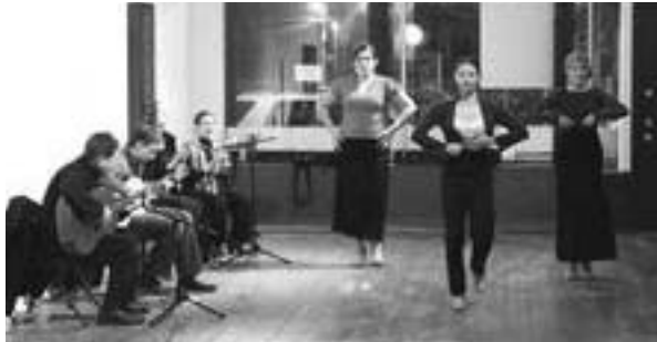
The Chicago Arts District offers a self-guided walking tour of the 2nd Friday of the month from 6 to 10 p.m. The event begins at 1821 S. Halsted for maps and details, 30 galleries, creative spaces and over 50 artists will be available.