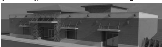
Starting our second century of service.

SZYKOWNY FUNERAL HOME LTD. 4901 S. Archer Avenue (773) 735-7521