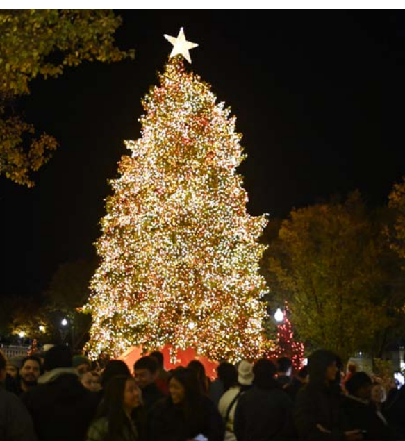
City of Chicago 2023 City Tree

The Department of Cultural Affairs and Special Events announced details for 2024 holiday traditions at Millennium Park, 201 E. Randolph st. Chicago's Christmas Tree will be displayed near the intersection of Michigan ave. and Washington st. The annual Tree Lighting Ceremony and fireworks, will be broadcast live by CBS Chicago on Friday, Nov. 22nd at 6 p.m. The main stage will be located on Washington st. adjacent to the Chicago Cultural Center. Other holiday activities include the return of the McCormick Tribune Ice Rink, on Friday, Nov. 15th. The Holiday Market from Nov. 22nd to 24th and the return of the Holiday Sing-Along series every Friday between Dec. 6th and Dec. 20th at 6 p.m. The Park is open daily from 8 a.m. to 9 p.m. Plan your visit at MillenniumPark.org.