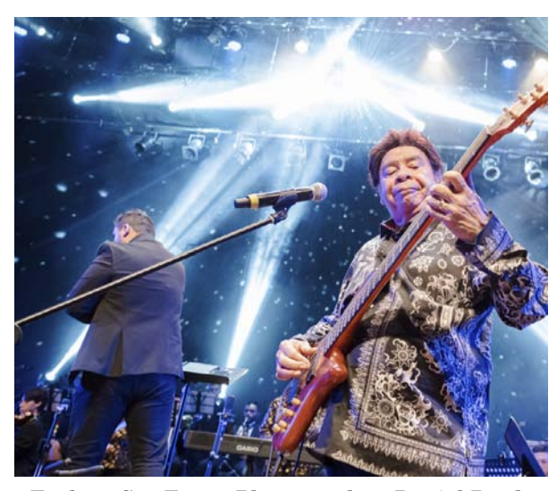
Fruko y Sus Tesos.

The Department of Cultural Affairs and Special Events announces the 2024 Millennium Park 20th Anniversary Summer Season most Mondays and Thursdays, July 1st to Aug. 8th at 6:30 p.m. This seven-part music series showcases a wide range of genres at the Jay Pritzker Pavilion. Pre-shows begin at 5:30