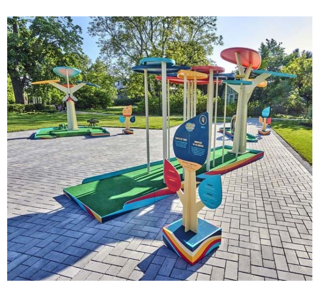
Wonder Woods Mini Golf

The cicada emergence has begun at The Morton Arboretum, 4100 Illinois Route 53, Lisle. Scientists estimate that in a forested area there can be up to 1.5 million cicadas per acre. Their presence will last only about four to six