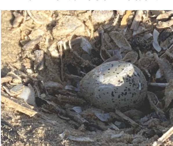
The Chicago Park District announce the presence of a new egg on the protected area at Montrose Beach Dunes along the shoreline, near the Monty and Rose Wildlife Habitat. The egg is the product of the recent pair bond between nativeborn Piping Plover Imani, who hatched at Montrose in 2021, and Searocket, one of the 5-week-old captive-reared chicks that were released into the wild at Montrose in July 2023.

In a successful scenario, the chicks would return to Montrose Beach Dunes to nest. Documented migration suggests that captive-reared chicks are more likely to return to their release beach the following spring. The experiment worked, and Chicago is awaiting the arrival of a