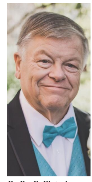
By Dr. R. Pletsch

If you have a good relationship with a college student -- by this I mean that you can talk and listen without getting upset -- many of these students will tell a different story than you may understand from just listening to TV and the selective press reports. You may be surprised to hear the names of groups FIRE, Turning Point and Blexit. These are a few of the groups I've heard about and what they stand for. It is easy to look them up on the inter-net. In short, FIRE stands for Foundation for Individual Rights and Expression. Turning Point is a conservative organization that calls for all to have freedom of speech in public places like universities. Blexit is an organization that