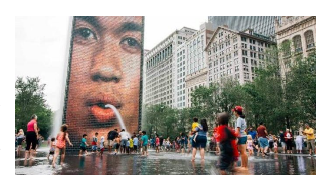
Crown Fountain by Jaume Plensa

Docent guided tour of public art works on the Millennium Park Campus that covers approximately one-half mile will be held on the 1st and 3rd Saturdays of each month, through Oct. 7th at 12 noon. Start and end at the Chicago Cultural Center Randolph Street steps. Space is limited to