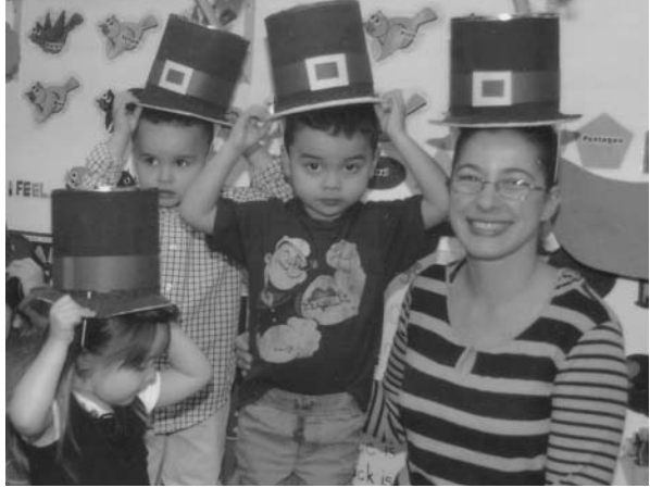
The children of Kid'z Colony Daycare, 6287 S. Archer, made pilgrim hats for their Thanksgiving feast. Winter registration is now open for children 13 months to 10 years. For more information, call (773) 767-8522.