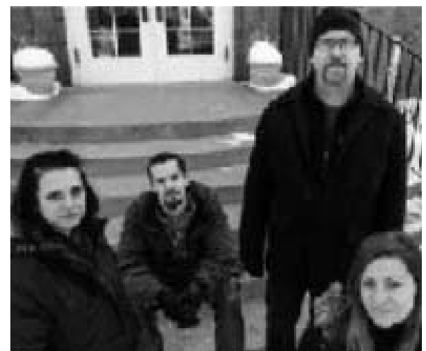
GREEN LEAF BAND

The McKinley Park Advisory Council will sponsor the Farmers Market Summer Concert Series at the President Monument, Archer & Western blvd. on Sundays from 12 noon to 1:15 p.m. Attendees should bring a chair or