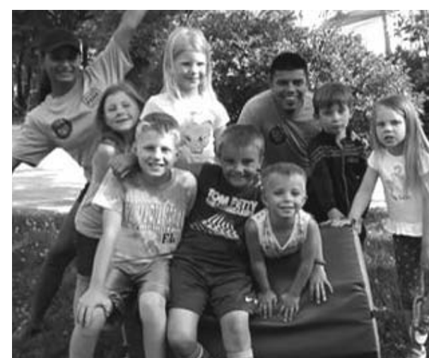
The Chicago Park District will send the Rollin' Rec activity van to Hoyne Playground, 3417 S. Hamilton on Tuesday, Aug. 14th and Thursday, Aug. 16th from 1:30 to 2:30 p.m.

Sports, gymnastics and fitness activities will be available for all ages. Registration is not required.