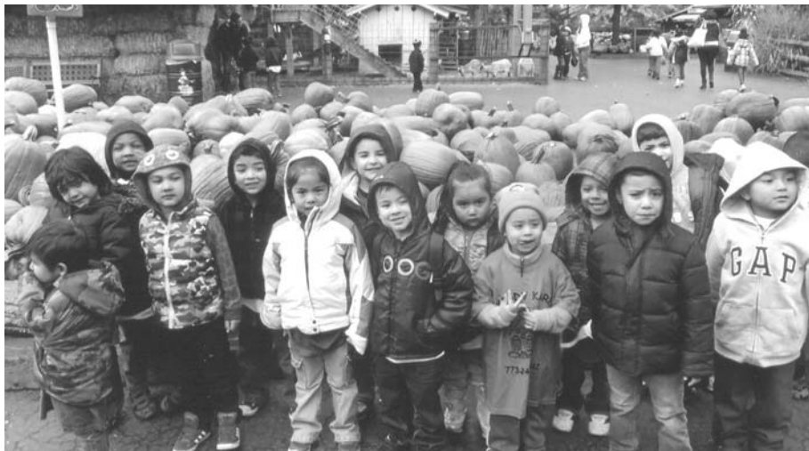
Kiddy Kare, 4401 S. Kedzie, took the pre-school children on a field trip to Bengston Farm in Homer Glen. Attendees enjoyed a tour of the farm and returned home with a pumpkin.