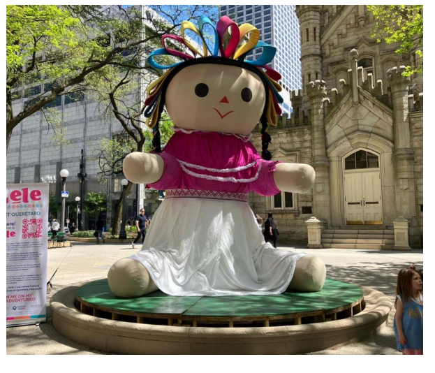
Lele Doll - Mexico Week in Chicago

The Consulate General of Mexico in Chicago announces Mexico Week, an annual celebration of Mexican culture, centered around the festivities of Cinco de Mayo. Its third edition will feature the states of Chihuahua, Nayarit and Querétaro, along with the City of Durango from May 3rd to