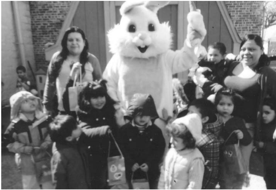
Kiddy Kare Pre-School, 4401 S. Kedzie, had a visit from the Easter Bunny who helped make their school party extra special. The children had a great time hunting for eggs and enjoying treats.