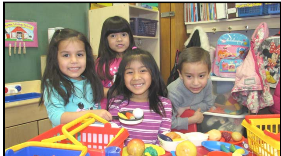
St. Bruno School invites you to POP IN and PLAY PRESCHOOL OPEN HOUSE Friday, April 11th 9am-11am 4839 S. Harding Avenue 773.847.0697 www.stbruno.com