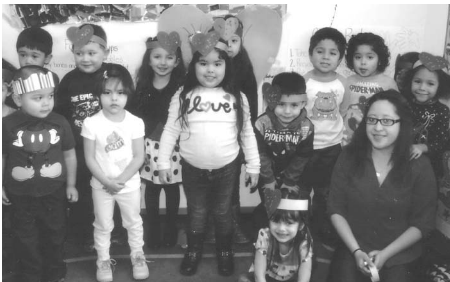
The children of Kid'z Colony Day Care, 6287 S. Archer celebrated Valentine's Day by making hats and various crafts. Registration is now open for ages 13 months to 10 years. State aid for a variety of programs is available for parents who qualify. For more information, call (773) 767-8522.