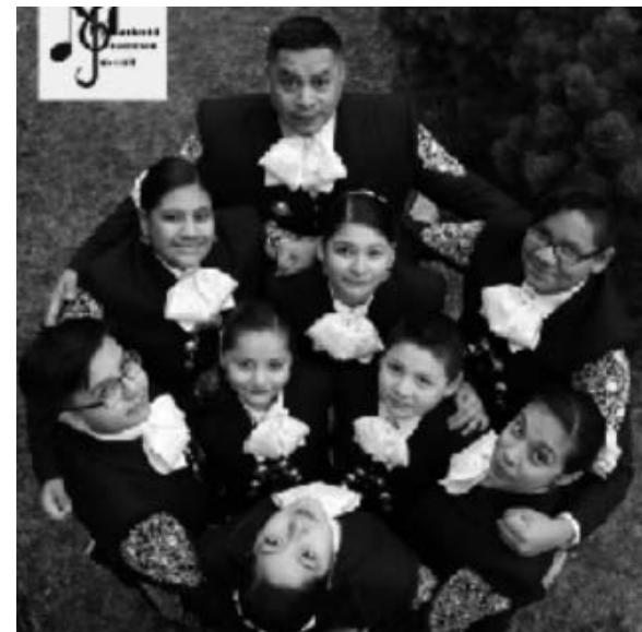
MARIACHI TRADICION JUVENIL

The McKinley Park Advisory Council will sponsor the Farmers Market Summer Concert Series at the President Monument, Archer & Western blvd. on Sundays from 12 noon to 1:15 p.m. Attendees should bring a chair or blanket.