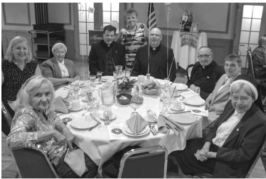
The Sisters of St. Casimir Auxiliary will host its 98th annual Auxiliary Banquet at Mama Luigi's Restaurant, 7500 S. Harlem on Sunday, Oct. 7th at 1:30 p.m. Doors will open at noon. Everyone is cordially invited to attend and support the works of the Sisters, in which they have been involved for over 110 years. Reservations are required by Oct. 1st at (773) 881-8724. The cost is $35 per person. For more information, contact the SSC Auxiliary at (773) 349-8060.