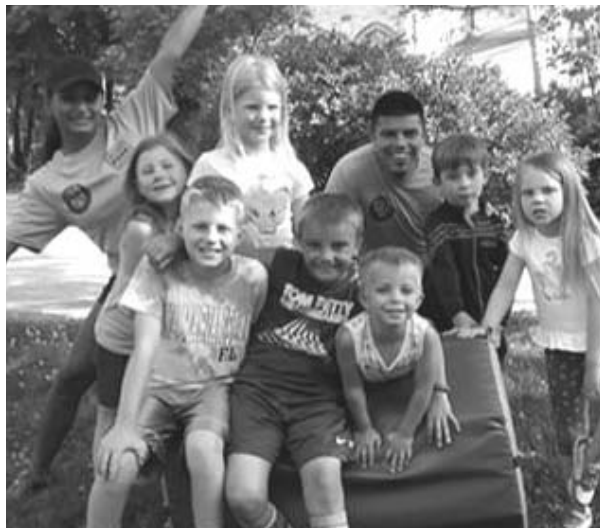
The Chicago Park District will send the Rollin' Rec activity van to Hoyne Playground, 3417 S. Hamilton on Tuesdays through Aug. 14th and Thursdays through Aug. 16th from 1:30 to 2:30 p.m.

Sports, gymnastics and fitness activities will be available for all ages. Registration is not required.