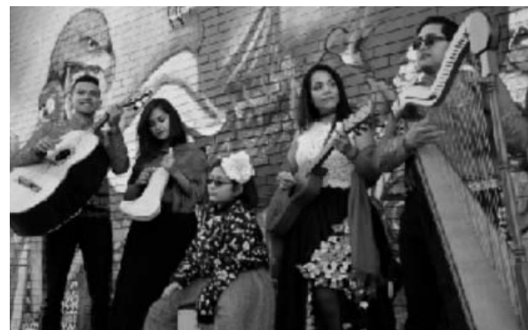
A FLOR DE PIEL BAND

The McKinley Park Advisory Council will sponsor the Farmers Market Summer Concert Series at the President Monument, Archer & Western Blvd. on Sundays from 12 noon to 1:15 p.m.