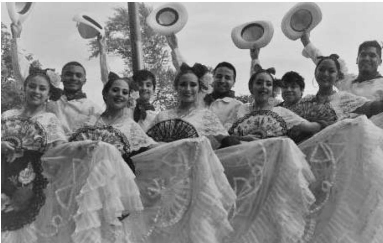
The Mexican Folkloric Dance Company of Chicago will perform during the Mariachi Vargas de Tecalitlan Show at the Copernicus Center, 5216 W. Lawrence ave. on Saturday, March 31st. For ticket information, call (708) 407-0800.