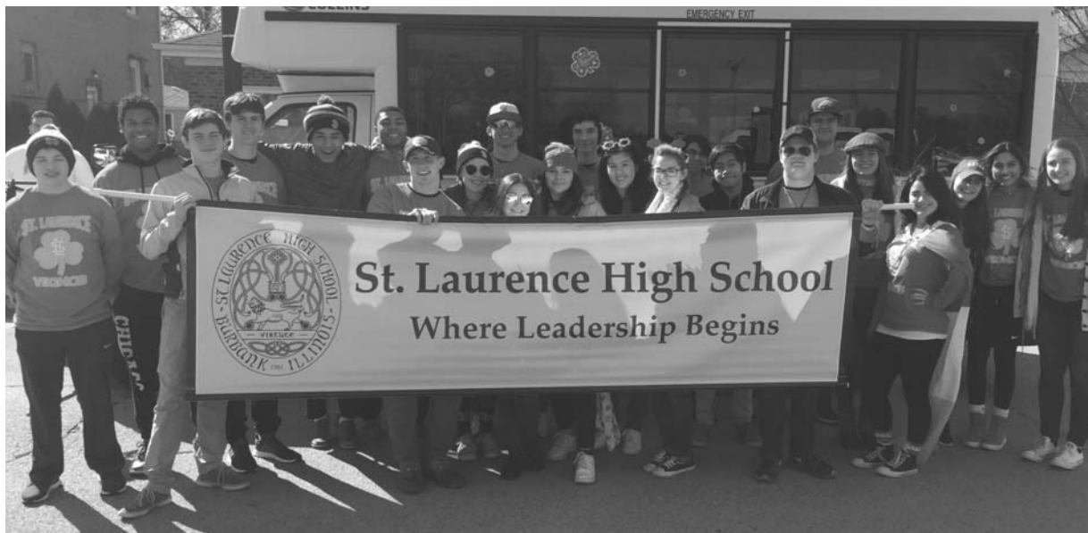
St. Laurence High School raised over $8,000 by selling 700 St. Patrick's Day shirts, with proceeds going to the Paul Bauer Memorial Fund which benefits the family of the fallen Police Commander who lost his life on Feb. 13th. Students wore the shirts as they marched in the South Side Irish Parade on March 11th.