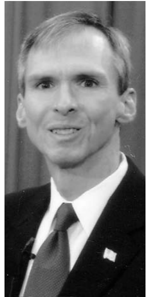
CONGRESSMAN D. LIPINSKI