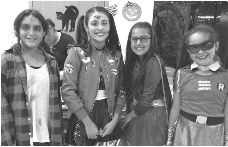
The 8th grade class of St. Bruno School hosted a spooktacular Halloween party on Oct. 26th. Over 250 guests enjoyed Halloween themed games, a haunted house, a slime making area, photo station and food prepared by parents.