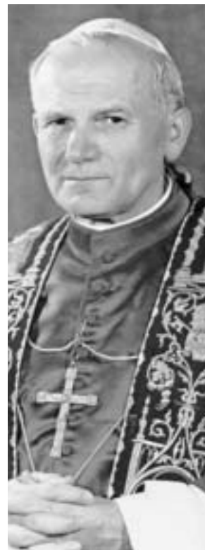
Saint John Paul II

Saint John Paul II holds a special place in the hearts and homes of the people of Five Holy Martyrs Parish, as well as the Brighton Park community on the southwest side of Chicago, since he celebrated a Mass on October 5, 1979 at a special altar erected in our parish parking lot specifically for his visit. The Mass was attended by thousands of people who crowded the lot and the streets before dawn just to catch a glimpse of our Holy Father and be a part of that historical day. The main part of this altar still remains in our lot and a Mass commemorating the anniversary of Saint John Paul II's visit is celebrated at this altar every year on the first Sunday of October. The Pope John Paul II Centrum Committee of our Parish worked tirelessly to raise over $100,000 in order to renovate this altar to make it a more permanent fixture in our community for individuals to come and honor Saint John Paul II in prayer.