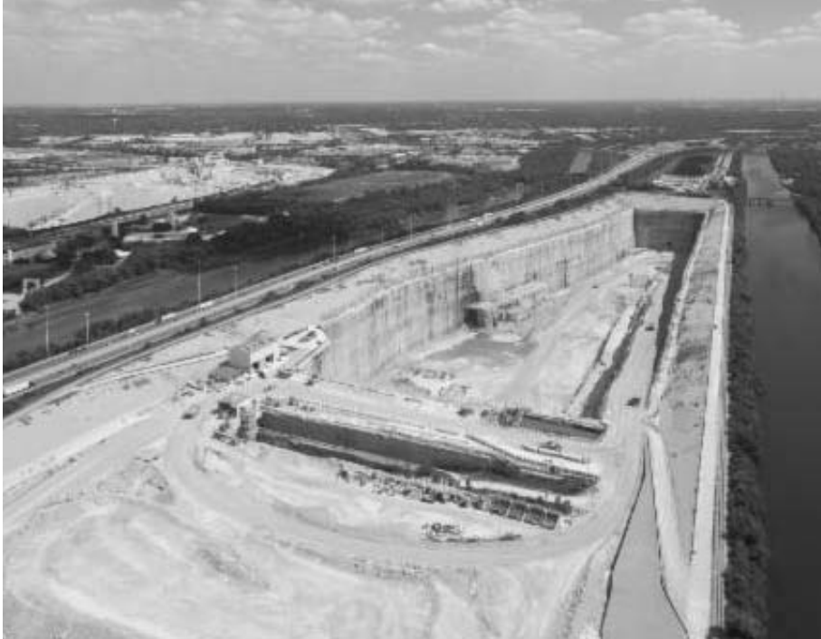
Phase one of the McCook Reservoir, part of the MWRD's Tunnel and Reservoir Plan, is set to be complete by the end of 2017, and visitors will be able to get a closer look for a limited time.

The Metropolitan Water Reclamation District of Greater Chicago will host public tours of the first phase of the McCook Reservoir on Sundays: Aug. 6th and 27th, Sept. 17th and 24th, Oct. 1st and 15th between 9 a.m. and 2 p.m. Each tour takes approximately two hours. Participants must wear sturdy footwear, no sandals, high heels, shorts or dresses allowed.