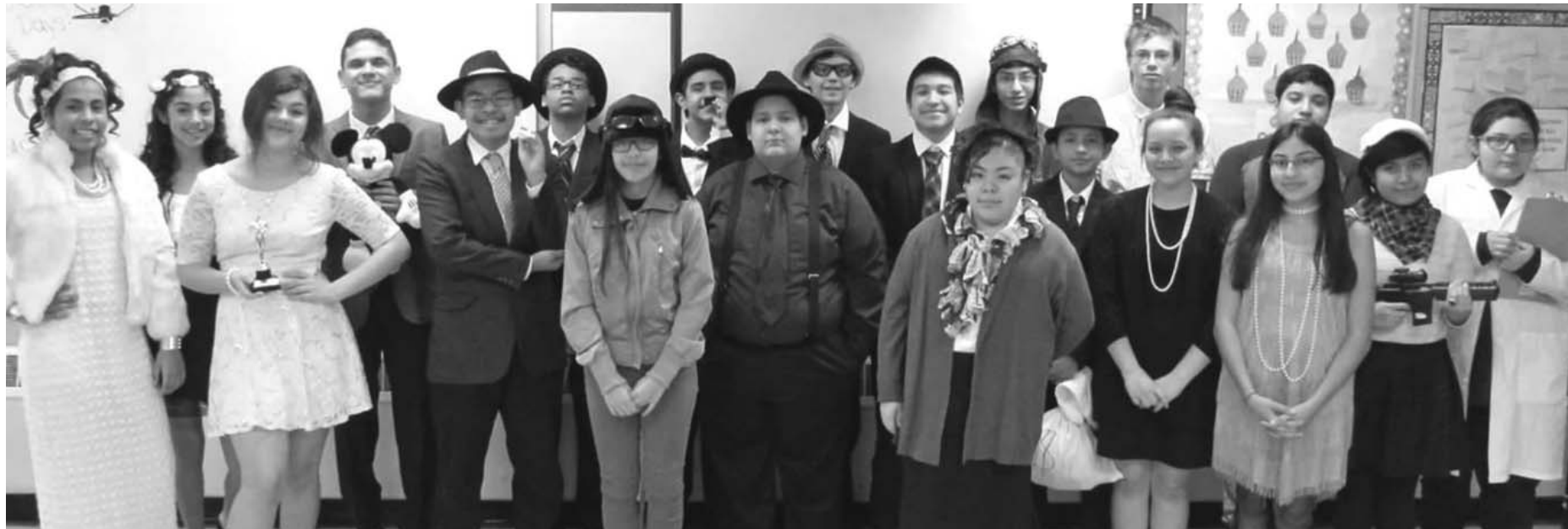
The 8th grade class at St. Bruno School, 4839 S. Harding is studying events from the Roaring 20's era. Each student was asked to choose an influential person from the era, dress up as that person and present their contributions.