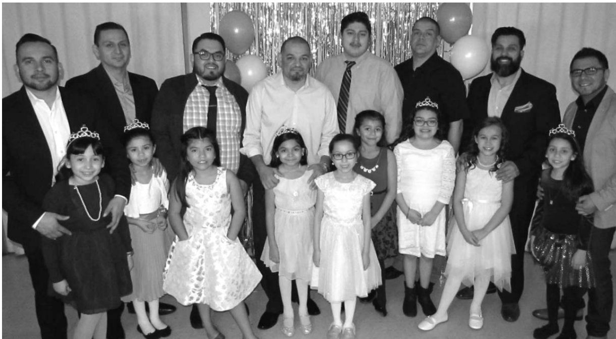
St. Bruno School, 4839 S. Harding, conducted its annual Father-Daughter Princess Ball on March 2nd. The event provides treasured memories.