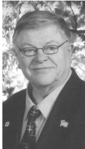
By Dr. R. Pletsch

Catalyst Magazine is celebrating its 25th anniversary as a voice of school reform. The latest issue printed several statistics compiled by the Board of Ed covering the 25 year span. The ones I found intriguing were the changes in schools over the period. In 1990 there were 520 schools and 401,554 students. But in 2015 the number of schools had increased to 660 schools but the population of students was down to 395,079. One could only wonder how low it would be if it were not for the numerous private schools that had closed in this period of time.