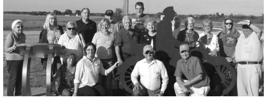
The Central Stickney Park District recently held an exceptional daytrip down Historic Route 66 to visit Plainfield, Joliet, Wilmington, Braidwood, Gardner, Dwight, Odell, Pontiac and Chenoa. Lunch was served at the Polka-Dot Drive In in Braidwood. The travelers are pictured at the old District 6 State Police Headquarters outside of Pontiac.