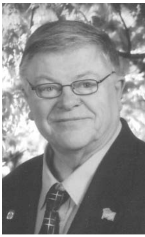
BY DR. R. PLETSCH

The Illinois State Board of Education has approved a new system it plans to use to rate schools and school districts. The only question that remains before full implementation is if the state needs approval from the US Department of Education because this rating system relies less on academics than the system they had earlier presented to the Department.