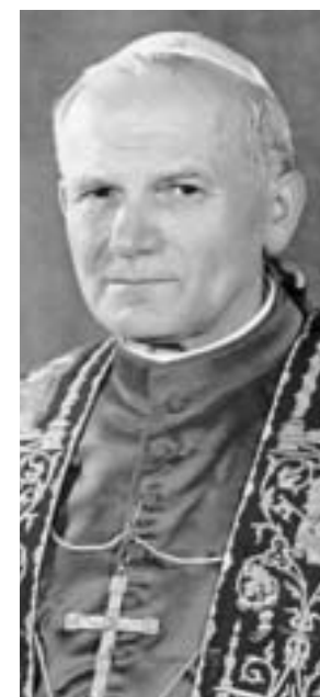
SAINT JOHN PAUL