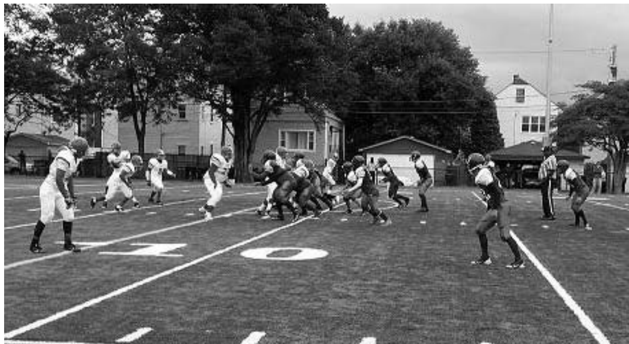
For the first time in school history, the Kelly High School Homecoming Football game will be played at home on Thursday, Sept. 24th at 5 p.m. The Trojans will host the University of Chicago Woodlawn Charter School Warriors on the brand new football/soccer field in Kelly Park, 41st and California. The Trojans are currently 2-1 on the season. Admission is free and all members of the community are welcome to attend.